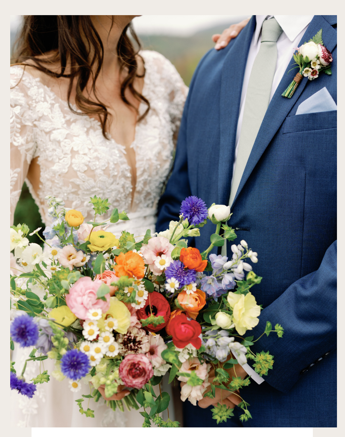
Wedding Packages PRICE GUIDE